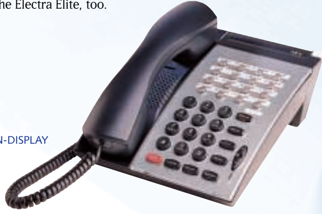
16 16-LINE NON-DISPLAY

An intelligent option for users who require multiple lines and multiple functions.