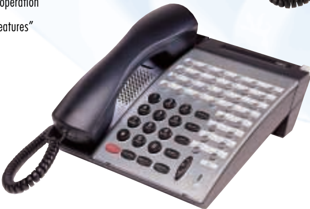
32 32-LINE NON-DISPLAY

Perfect for an answering position or backup console — offers direct station selection (DSS) for one-key access to employees.