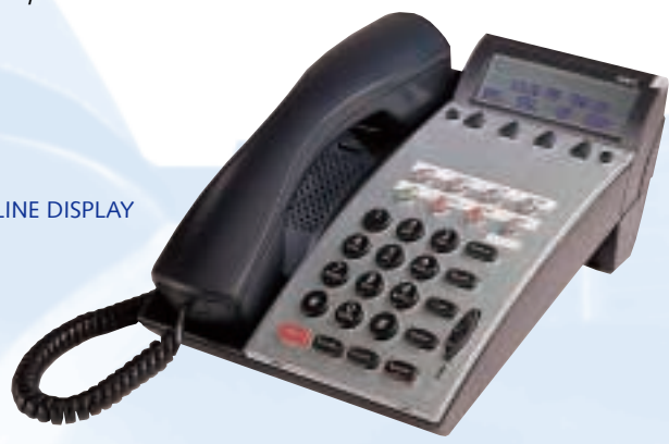
8 8-LINE DISPLAY

Brings 3 lines of LCD information to the standard user station. It is an ideal solution for middle management personnel, sales staff and customer service operations.