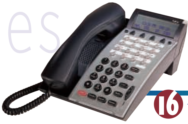
16 16-LINE DISPLAY

The Electra Elite supports a variety of ergonomically designed Multiline Terminals that are compatible with the system, offer "SoftKey" functionality, and are available in 8-line, 16-line and 32-line capacities — in both display and non-display models. A 60-line attendant console is also available. Choose which models work best for you. And, if you already have NEC's Electra™ Professional Telephones, those phones will work with the Electra Elite, too.