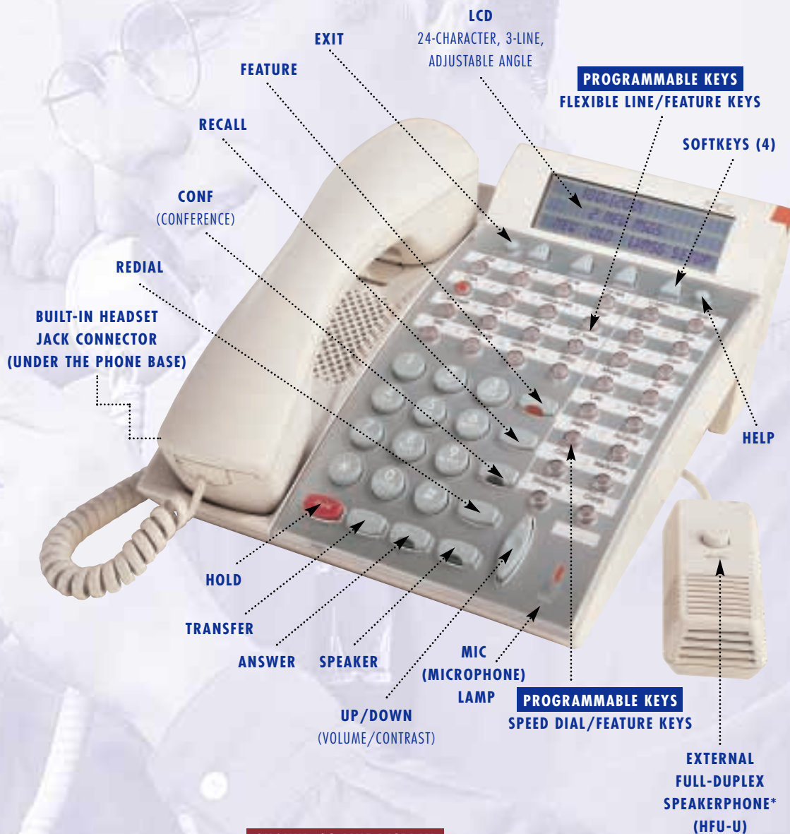
SHOWN: 32-LINE DISPLAY